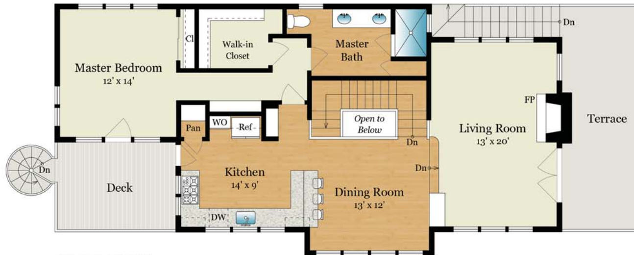
UPPER LEVEL 1,150 SQ FT